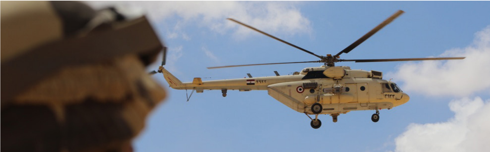
Mi-17 transport helicopter passes an Egyptian Special Operations Forces convoy, Egypt. Photo taken September 11, 2021.